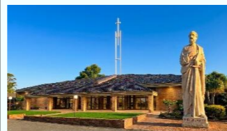
St Paul the Apostle, pray for us