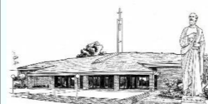
St Paul the Apostle, pray for us